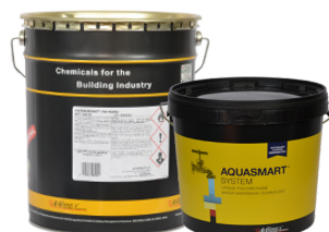
HYPERDESMO PB-1K-FC / AQUASmart PB