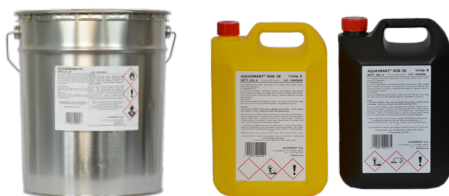
MICROSEALER-50 / AQUASmart-DUR