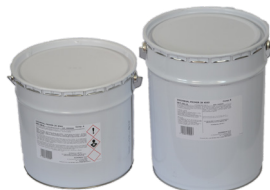
UNIVERSAL PRIMER- 2K-4060