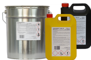
GEODESMO-50 / AQUASMART®-DUR