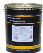
HYPERDESMO ® -ADY-E