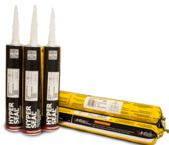
HYPERSEAL ® -EXPERT-150