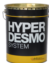
HYPERDESMO ® System