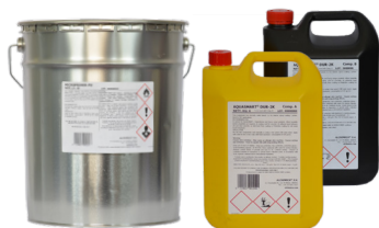
MICROSEALER-50 / AQUASMAST®-DUR