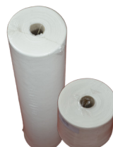
GEOTEXTILE 50 PRESSED or 45 PRESSED