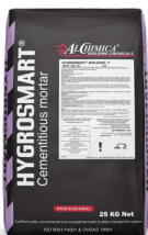
HYGROSMART®-BUILDING-F HYGROSMART®-BUILDING-45-THIXO HYGROSMART®-FIX & FINISH