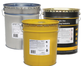
HYPERDESMO®-PB-2K HYPERDESMO®-PB-1K FC