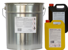
MICROSEALER-50 / AQUASMA®-DUR