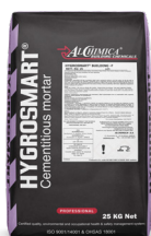
HYGROSMART®-BUILDING-F HYGROSMART®-BUILDING-45-THIXO HYGROSMART®-FIX & FINISH