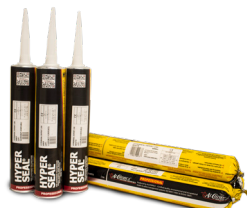
HYPERSEAL ® -EXPERT-150