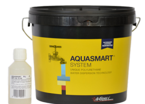
AQUASMA™-TC 2K Floor Protect