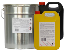
MICROSEALER-50 / AQUASMA™-DUR