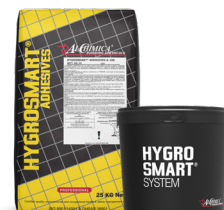
HYGROSMART®-ADHESIVE ULTRA 2K